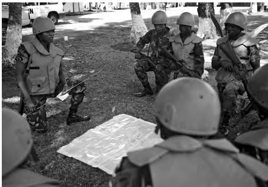
▲ Ghanaian peacekeepers in Buchanan, Liberia. April 2009.

Military planners should further ensure close working relations with gender specialists in the peacekeeping mission to strengthen information-sharing. Gender specialists can also facilitate the inclusion of local women's perspectives in information analysis and assessments, which will, in turn, inform the force commander's planning and the execution of mandated tasks.