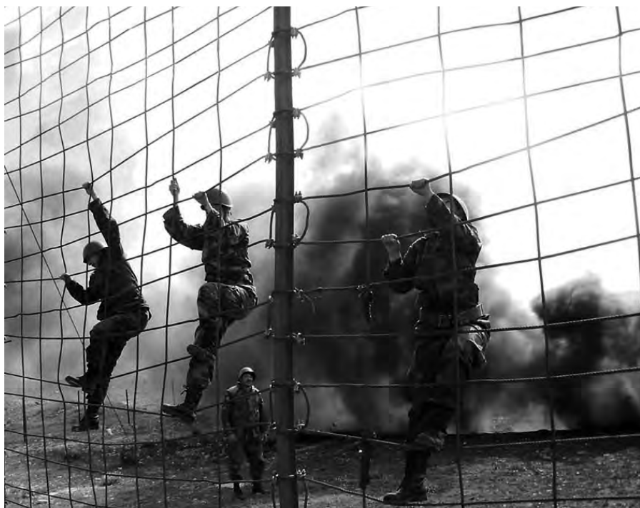
▲ Female military officers climb a rope ladder during training, 2009.

rights, including the role of national security forces in preventing violations of women's rights. Training support should include guidance to assist national security forces in preventing and protecting women and girls from sexual violence, underscore a zero-tolerance approach to the commission of such crimes by national security forces, and stress the role played by the national armed forces as the protectors of the civilian population. Advice should also emphasize equal access to and participation by male and female personnel of national armed forces in training activities.