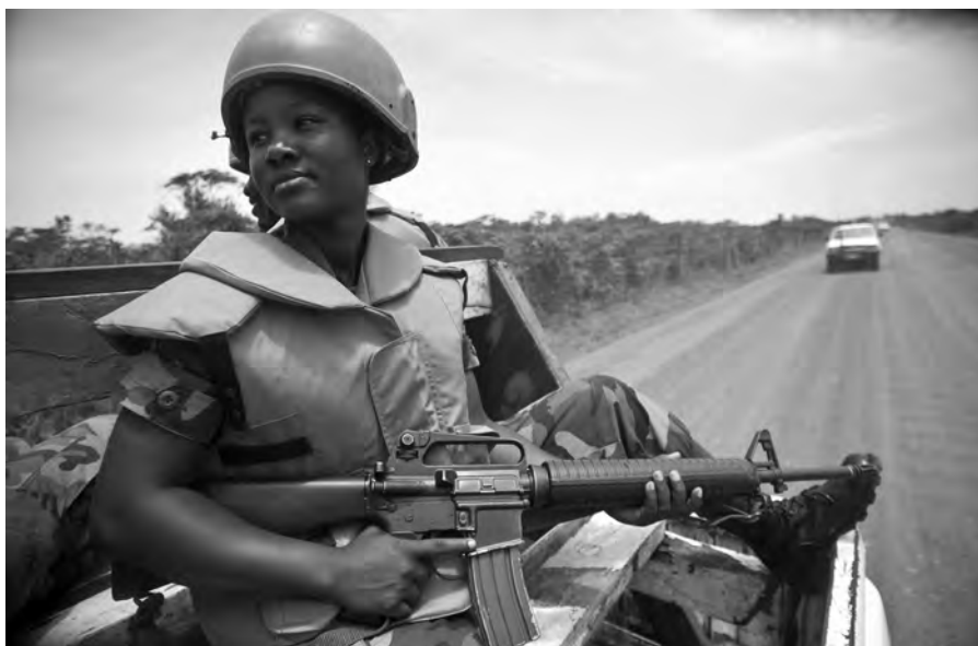
▲ Ghanaian peacekeeper on patrol in Buchanan, Liberia. April 2009.