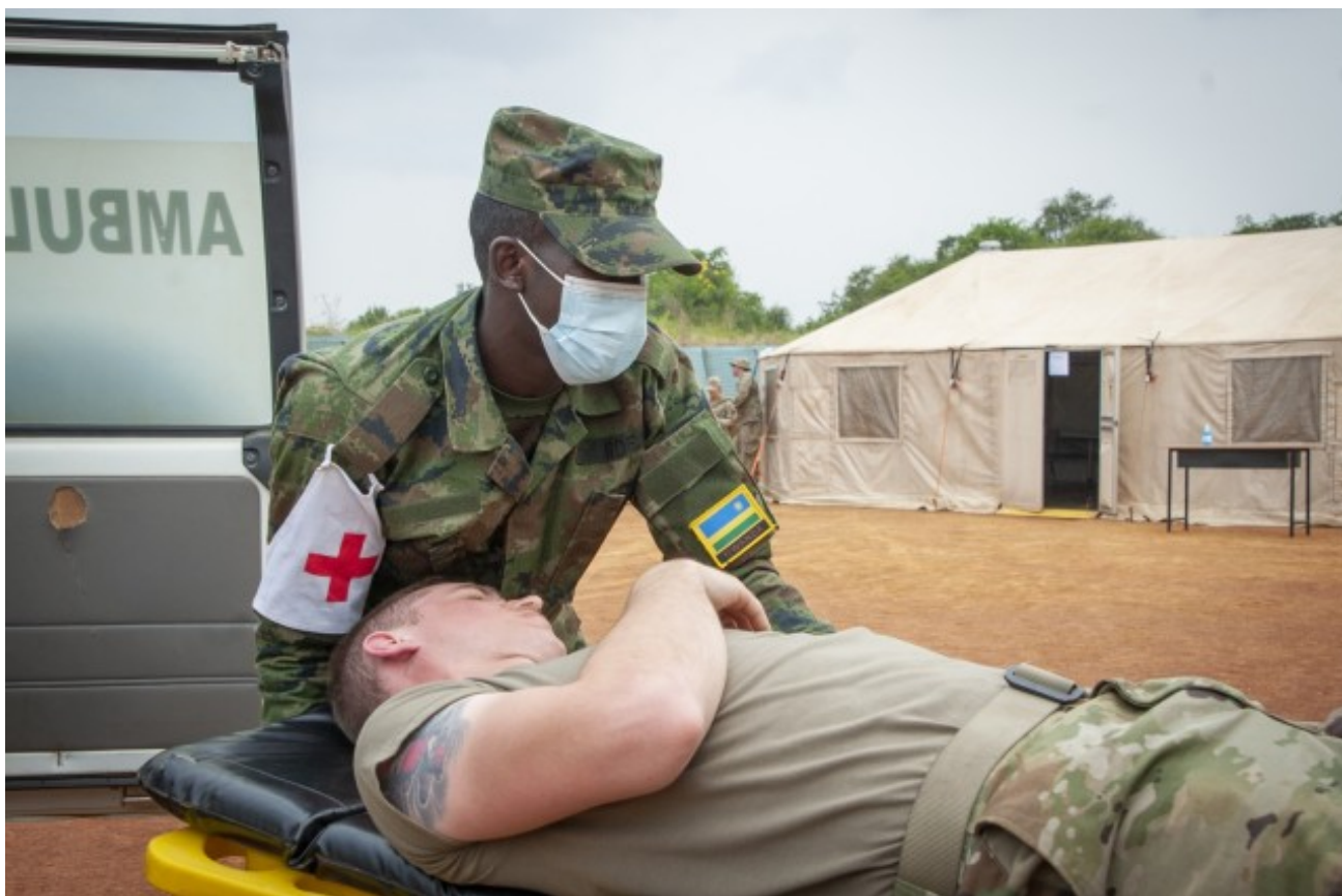
A medic from the Rwanda Defense Force's Medical Corps moves a patient -- in this case a volunteer from the Nebraska Army National Guard -- toward a United Nations Level 2 Hospital during a medical/engineering exercise conducted at Gako, Rwanda, in March. The exercise enabled members of the Rwanda Defense Force and the Nebraska National Guard to work together through the National Guard's State Partnership Program.

The pace of the partnership has already been substantial. In February, the Nebraska National Guard hosted the Rwanda ambassador in Lincoln. A few weeks later, three Nebraska Army and Air Guard noncommissioned officers traveled to Gabiro, Rwanda, for a leadership exchange. That was followed by a three-week exercise in March when 10 Nebraska Army and Air Guard medics and engineers traveled to Rwanda for a medical training exercise.