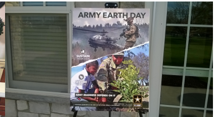
The Army's observance of Earth Day highlights the Army's environmental stewardship achievements and their benefits to warfighting readiness.