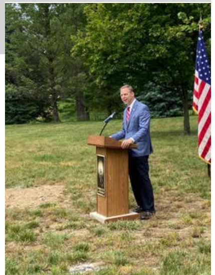
US Congressman Scott Perry speaks at USAWC groundbreaking, Jun 14: "The Army Birthday is a day of shared memories and shared sacrifices; your time in uniform is something you are proud of and never forget," said the

"It will be the standard all around the world and people will not only want to come here for the course, they'll fight – you fight to get into the war college and as soon as you get in you wonder what you did to yourself," Perry said with a smile. "But before that you fight to get in – and you want to come to a first-class facility and know that your country is maintaining the standard