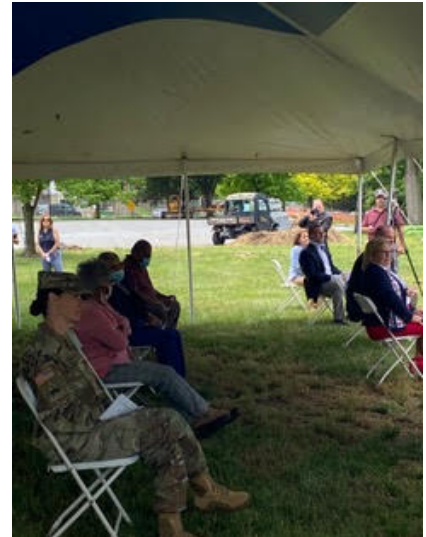
Ceremony, social-distancing: Carlisle and Cumberland regional officials join USAWC leaders Jun 14, 2020, to celebrate the start of construction on the new academic building, to be completed early 2023 for next-gen strategic leaders' education.