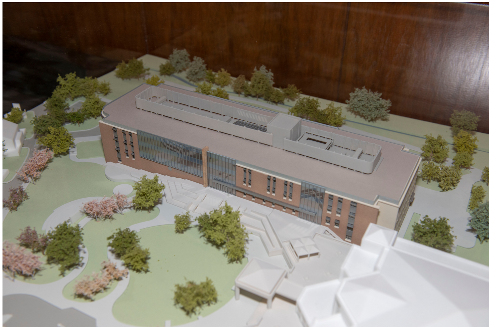
'Aerial view' of model: Army War College's new academic building, adjacent to Collins Hall (right)