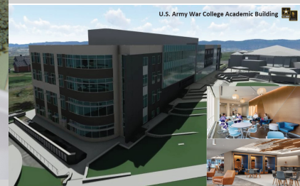
Artist's rendition of the Army War College academic building. Foundation construction will begin soon for a Winter 2022/ Spring 2023 occupancy by USAWC students.

The Army announced that Manhattan Construction Co., Arlington, Virginia, was awarded an $85,407,155 firm-fixed-price contract for construction of a new four-story, 201,000 square-foot general instruction building to support the U.S. Army War College. Bids were solicited via the internet with six received. Work will be performed in Carlisle Barracks, Pennsylvania, with an estimated completion date of March 29, 2023. Fiscal 2020 military construction, Army funds in the amount of $85,407,155 were obligated at the time of the award.