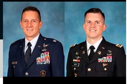
Secretary of Defense National Security Essay Competition; First Place – Lt. Col. Roderic Butz, United States Air Force, Third Place – Lt. Col. Eric V. Kreitz, United States Army.