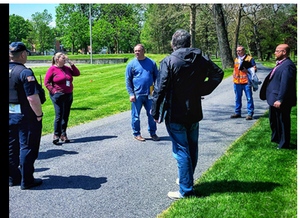
Representatives from the Army Corps of Engineers, the Directorate of Emergency Services and the Directorate of Public Works survey the proposed fence line for the new Army War College academic building project May 21, 2020.

When complete, the proposed fence line near Collins Hall will resemble the track in red, and the line in blue will approximate the temporary parking for faculty, students and staff.