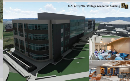
Artist's rendition of the Army War College academic building. Foundation construction will begin soon for a Winter 2022/ Spring 2023 occupancy by USAWC students.

The Army announced that Manhattan Construction Co., Arlington, Virginia, was awarded an $85,407,155 firm-fixed-price contract for construction of a new four-story, 201,000 square-foot general instruction building to support the U.S. Army War College. Bids were solicited via the internet with six received. Work will be performed in Carlisle Barracks, Pennsylvania, with an estimated completion date of March 29, 2023. Fiscal 2020 military construction, Army funds in the amount of $85,407,155 were obligated at the time of the award.