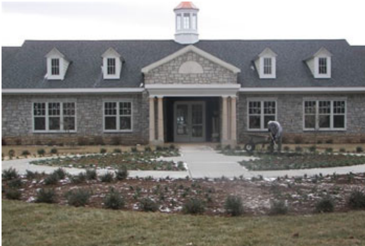
The Delaney Field Clubhouse,

a new community center on Carlisle Barracks, will celebrate a ribbon-cutting Feb. 5 at 10 am. The approximately $1.3 million facility features a community room, kitchen, TV lounge, internet café, and a children's play room, totaling 6,000 square-feet of space.