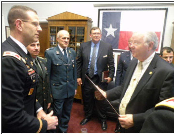
U.S. Congressman Joe Barton met with USAWC students.

The students and faculty also visited Capitol Hill, to talk face-to-face with the officials about issues facing the nations and the military including its legislative activities, and the impact on national security policy. Other organizations that hosted visits included the CIA, Department of Homeland Security, the Supreme Court, National Security Agency, Department of Commerce, the Anti-Defamation League and the British Broadcasting Corporation, among others.