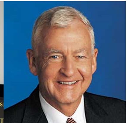
Gen. Dennis J. Reimer, Class of 1979