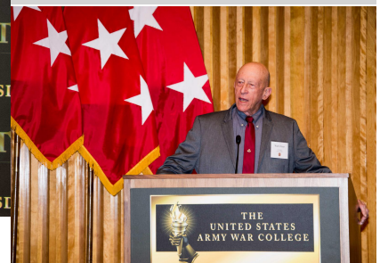
Lt. Gen. Walter F. Ulmer, Jr., Class of 1969

At 116 years old, the Army War College celebrated the contributions of the college and its graduates by honoring four outstanding alumni. These alumni were singled out for their exceptional service that followed military retirement and continues to reflect the values and strategic vision fostered by the Army War College. The event took place in Bliss hall.