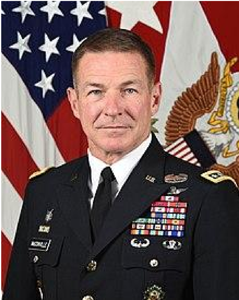
The 40th Chief of Staff of the Army, Gen. James C. McConville, is graduation speaker, June 11, 2021