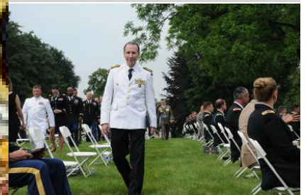
file photo: International Fellow of the Class of 2020 heads back to his seat after receiving his diploma at the Resident Education Graduation Ceremony, on historic parade ground of Carlisle Barracks.