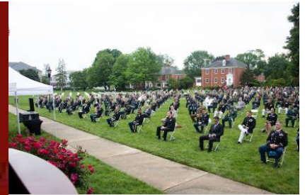
file photo: USAWC Resident Class of 2020 graduation ceremony, June 2020.