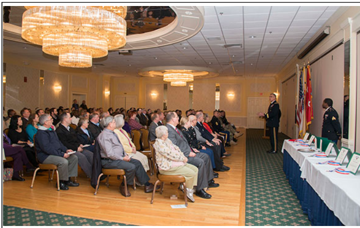
Maj. Gen. Bill Rapp, Army War College Commandant, addresses a packed Letort View Community Center Nov. 15 during the Installation Awards Ceremony.

Carlisle Barracks is often called “the most strategic 500 acres in the Army,” not just because it’s home to the Army War College, but because it is home to some of the best and brightest Soldiers and employees in the Army, according to installation leadership.