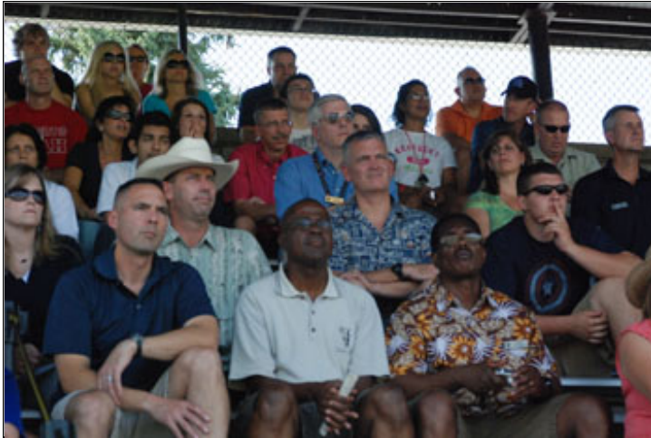
Members of the Army War College Class of 2012 watch the Opening Ceremonies.

The event featured performances by the U.S. Army Fife and Drum Corps, the U.S. Army Drill Team, the 3rd U. S. Infantry Regiment (The Old Guard) and the U.S. Army Band (Pershing's Own).