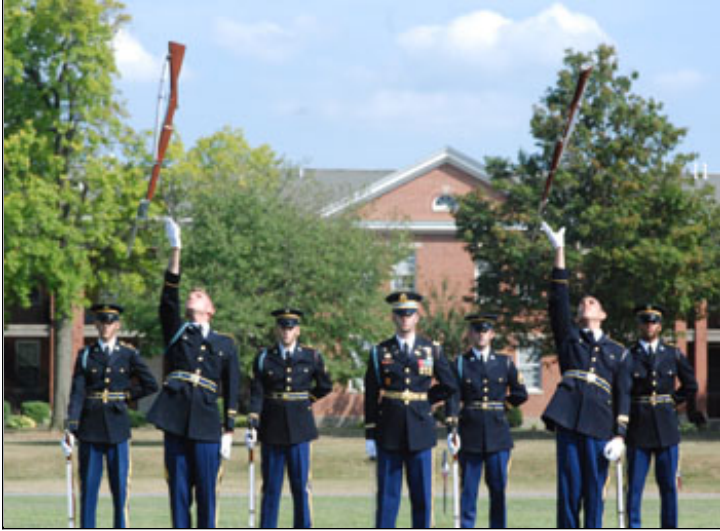
Two of the members of the Army Drill Team demonstrate synchronized rifle spinning during the Opening Ceremonies.